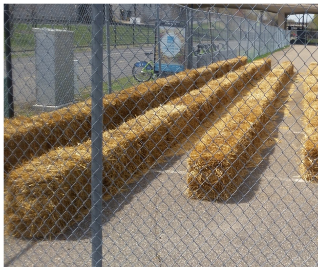
Jack Eckdahl's straw bales for gardening at Urban Ventures in Minneapolis