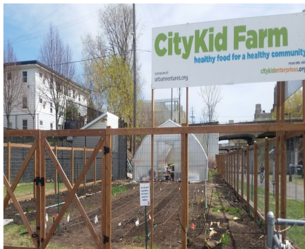
Seedlings preparing for the Christiania Urban Ventures garden