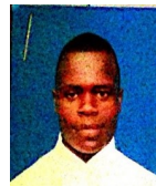
IMAGE LUTHERAN HIGH SCHOOL, P.O. BOX 1057, IRINGA - KILOLA, 16 th FEBRUARY 2015

Please know that the school year is well underway in Tanzania. We recently received a number of THANK YOU letters from students you sponsor through Bega Kwa Bega. Below please enjoy an example of one of these letters and know that the others are posted on the kiosk for your reading enjoyment.