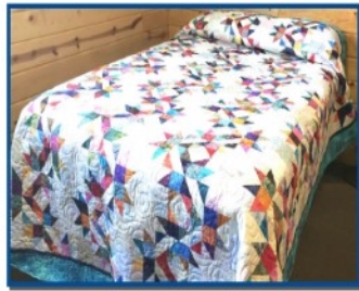
Raffle Quilt: 90"x107" Raffle tickets for this beautiful "Falling Star" quilt are available online, at the Camp Office, and during the auction. You do not need to be present to win.

We are excitedly making plans to return to Camp Onomia for our annual live quilt auction, bake sale, and silent auction! Be sure to invite your friends & family for this fun event. All proceeds support the year-round ministries of Camp Onomia.